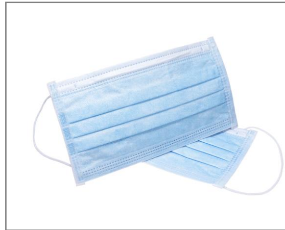
Medical Face Masks