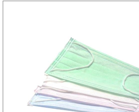
Cosmetics Face Masks